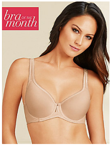
Wacoal #853192 Basic Beauty Spacer Underwire T-Shirt Bra $55.00