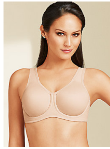
Wacoal #855170 Sport Underwire Bra $65.00