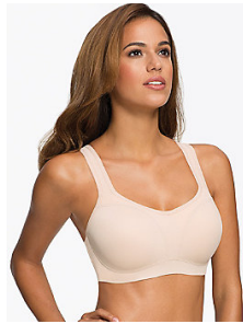
Wacoal #853209 Sport Underwire Bra $68.00