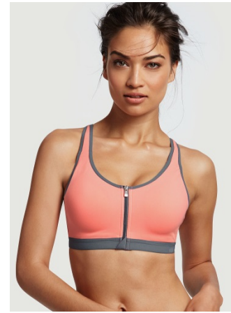
Knockout by Victoria's Secret Front-Close Sport Bra $56.50