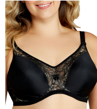
Yvette By, Goddess Full cup underwire bra with extra wide sides and back for maximum support. $65.55