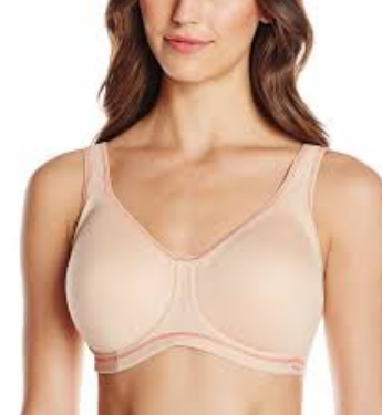
Sonic Sports Bra By, Freya Full cup underwire bra. Nice wide sides and back for extra firm support $69.95