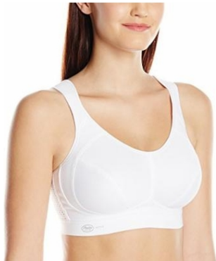
No wire sports bra by, Anita Full coverage extra wide sides for maximum support and wide straps to prevent shoulder grooves. $77.50

4295 Sergeant Road (By the Mall), 712-560-9127