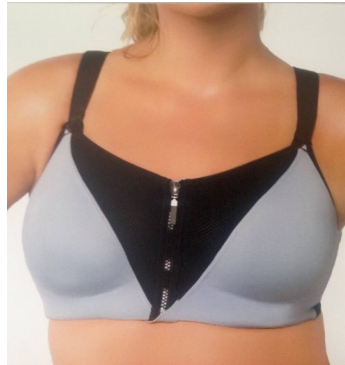
Zip Fit Sports Bra By, Curvy Couture Underwire front closure sports bra