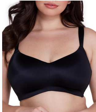
Flawless Contour Wire Free by, Curvy Couture Molded no-wire soft cups that give you the shape and support of underwire bra. Wide sides for back support.